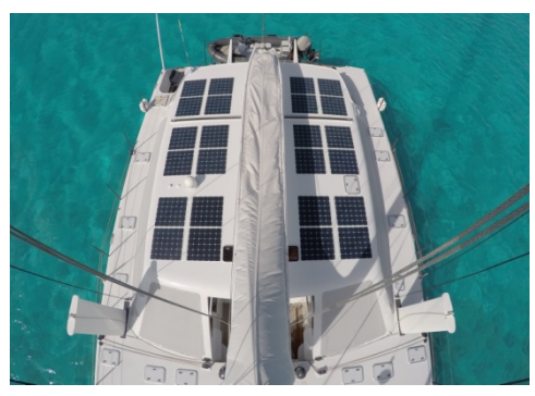
Highest Power, Lightest Weight

Available in a variety sizes, shapes & efficiencies